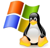
Support for all OS